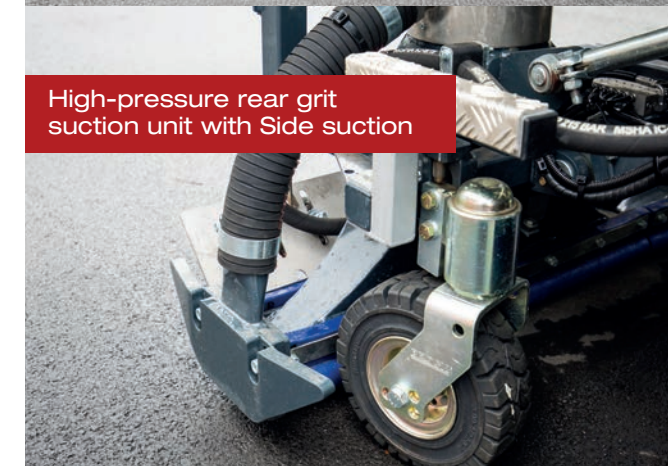
High-pressure rear grit suction unit with Side suction

Your sweeper as individual as you are - that is our strength. We find the perfect solution for your cleaning work. With a multitude of possibilities and variations, your machine becomes the ultimate cleaning professional. Please contact us or write to us: sales@brock-kehrtechnik.de